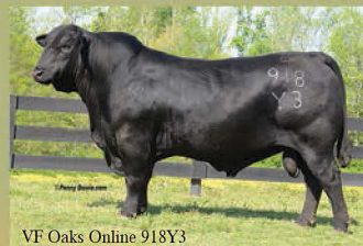
VF Oaks Online 918Y3

MC Granite ranks in top 10% for WW, YW, MM, TM, and top 20% SC, REA, IMF. (Reg#: UB10275960)