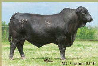
MC Granite 834B

Through the use of new technology and our research, we are building one of the elite Brangus programs here in the U.S.A.