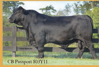
CB Passport 803Y11

An incredible female that is a bull producer. Her first three sons averaged over $9,000 at public auction. Full maternal sister to Hombre. (Reg#: R10211946)