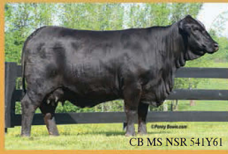
CB MS NSR 541Y61

VF Oaks Online ranks in top 2% for SC, top 25% BW, top 25% IMF, and top 35% WW. (Reg#: R10193636)